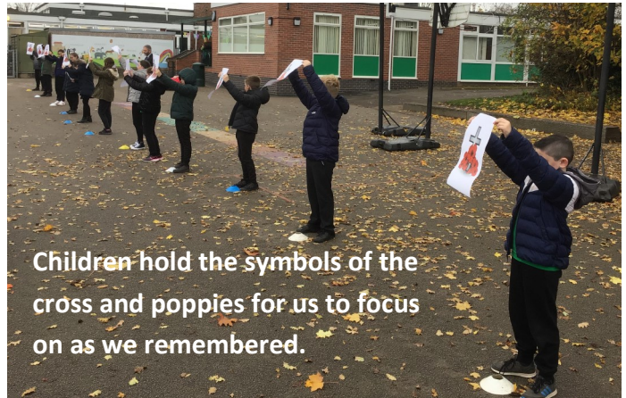
Children hold the symbols of the cross and poppies for us to focus on as we remembered.